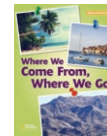
Where We Come From, Where We Go