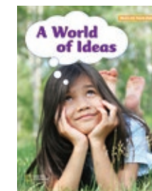
A World of Ideas