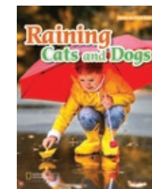
Raining Cats and Dogs