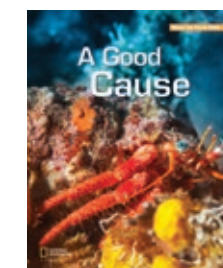
A Good Cause