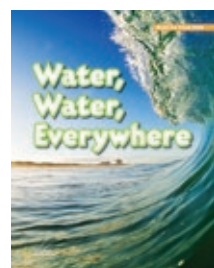
Water, Water, Everywhere