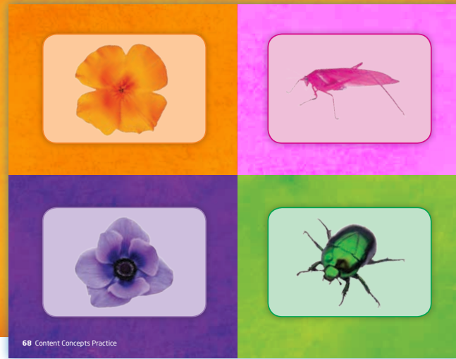
69 Content Concepts Practice

Objective Demonstrate understanding of the colors pink, green, purple, and orange