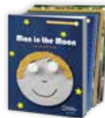
Read On Your Own Books (ROYO)