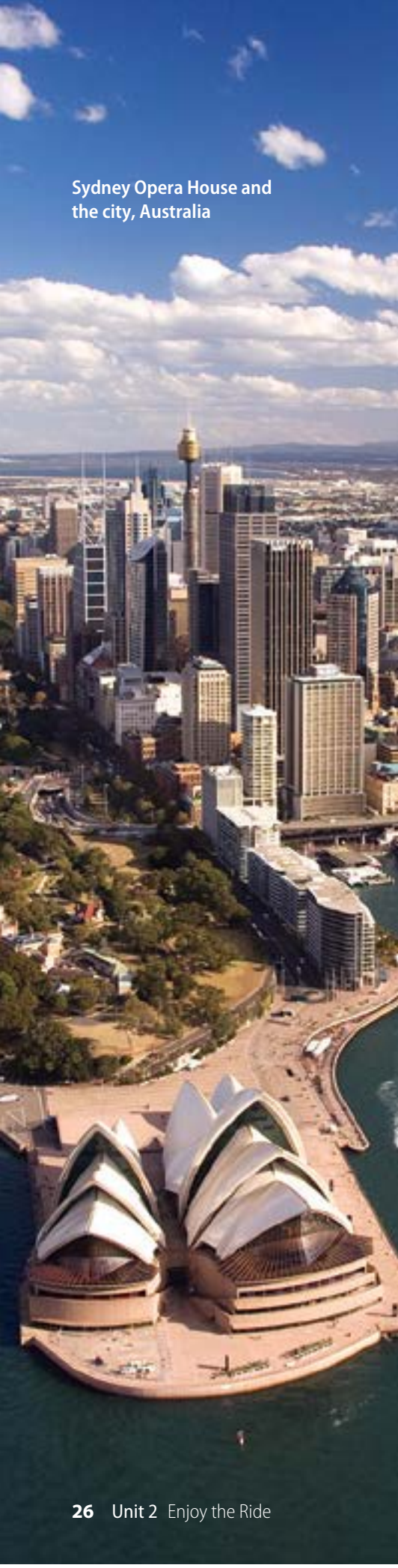
Sydney Opera House and the city, Australia