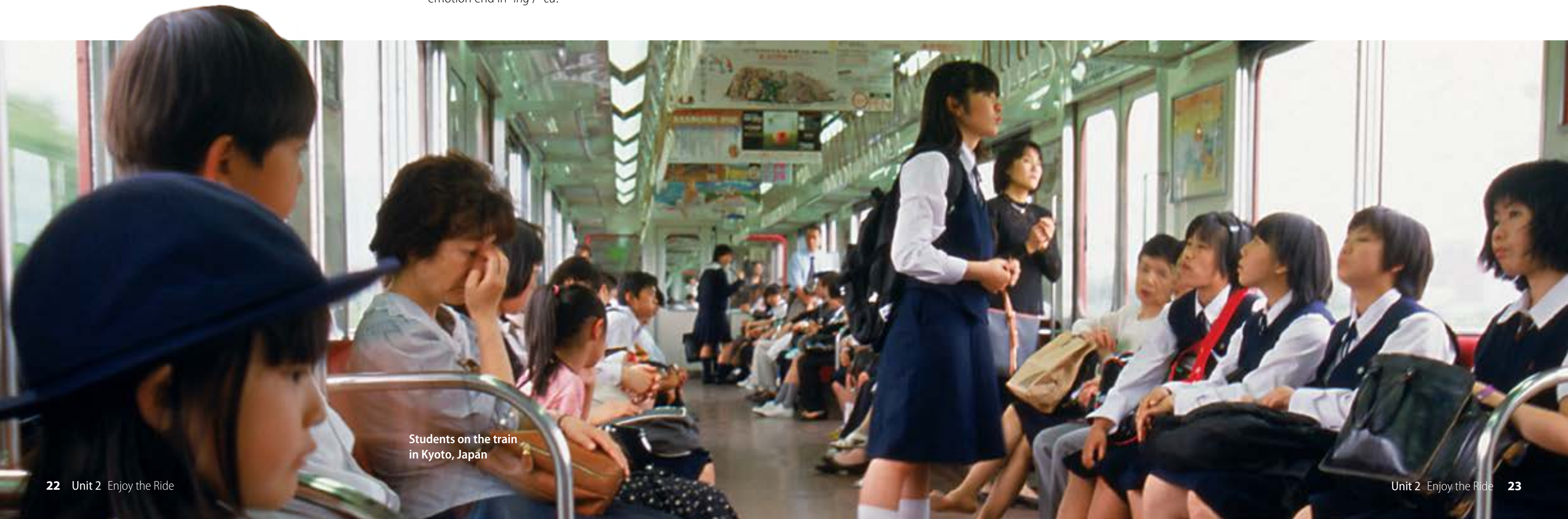
Students on the train in Kyoto, Japan