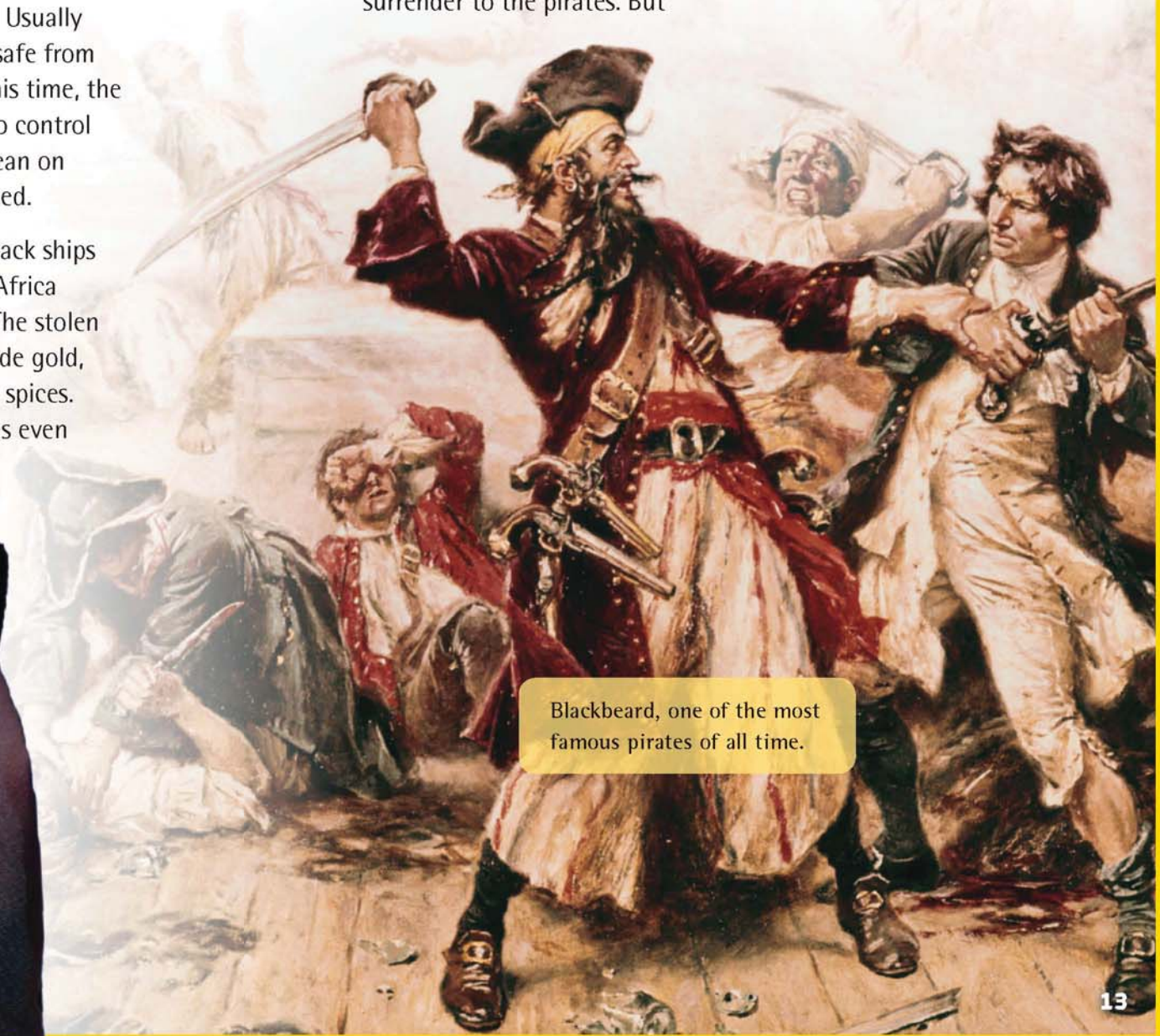
Blackbeard, one of the most famous pirates of all time.