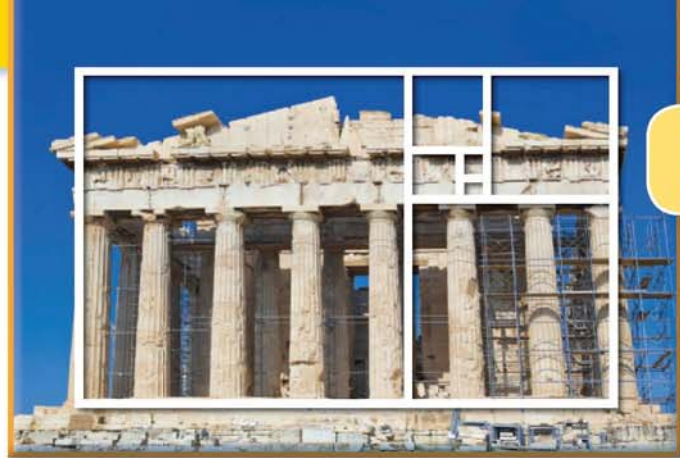
The golden ratio in the Parthenon

Ancient builders used the golden ratio to make beautiful buildings like the Parthenon in Greece.