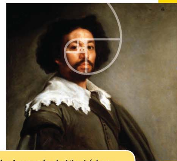
The golden ratio in paintings by Leonardo da Vinci (above, left) and Diego Rodríguez de Silva y Velázquez (above, right)

The faces of popular and beautiful movie stars often show the golden ratio, too. However, different people have different ideas about what looks beautiful. That's what makes the world such an interesting place!