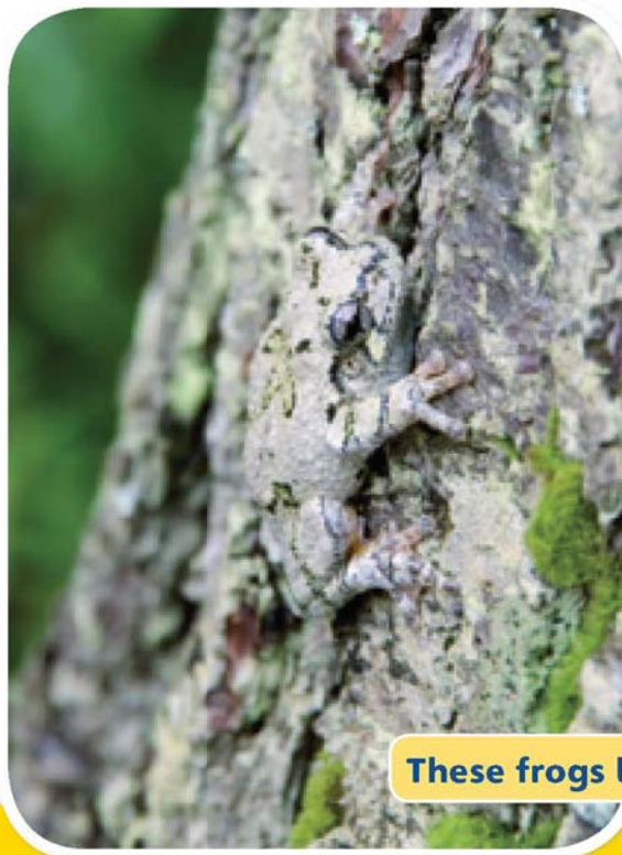
These frogs look like trees.

Look at the pictures. Can you find the frogs?