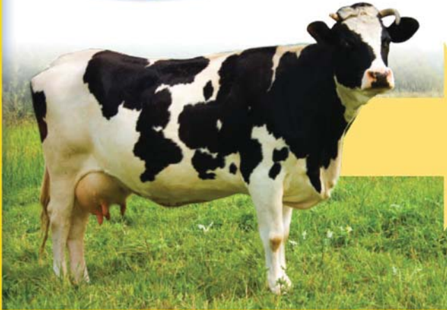
Milk comes from cows.