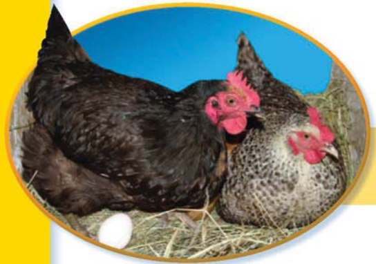
Eggs come from chickens.