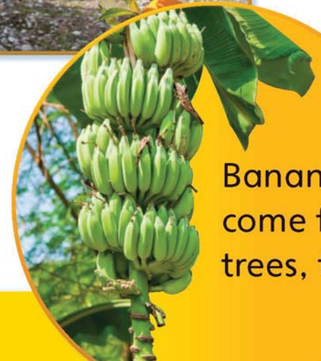
Bananas come from trees, too.