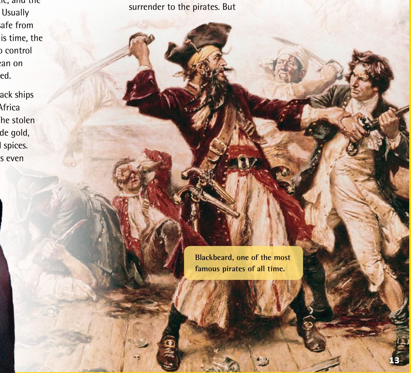
Blackbeard, one of the most famous pirates of all time.