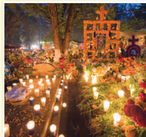
Day of the Dead

The Day of the Dead is a big festival in Mexico. People celebrate it on the first day of November. They remember and celebrate the dead people in their family. They sometimes decorate the graves in the cemetery with skeletons in special costumes. Families take a big feast to the cemetery, and they light candles and play music. Sometimes there are fireworks, too. People give candy and chocolate in the shape of skulls. For Mexicans, skulls and skeletons are not scary, and the festival is not sad. The Day of the Dead is a time for fun and happy celebrations.