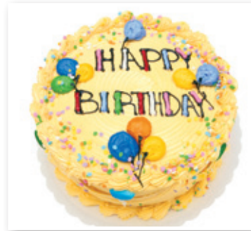
a birthday cake