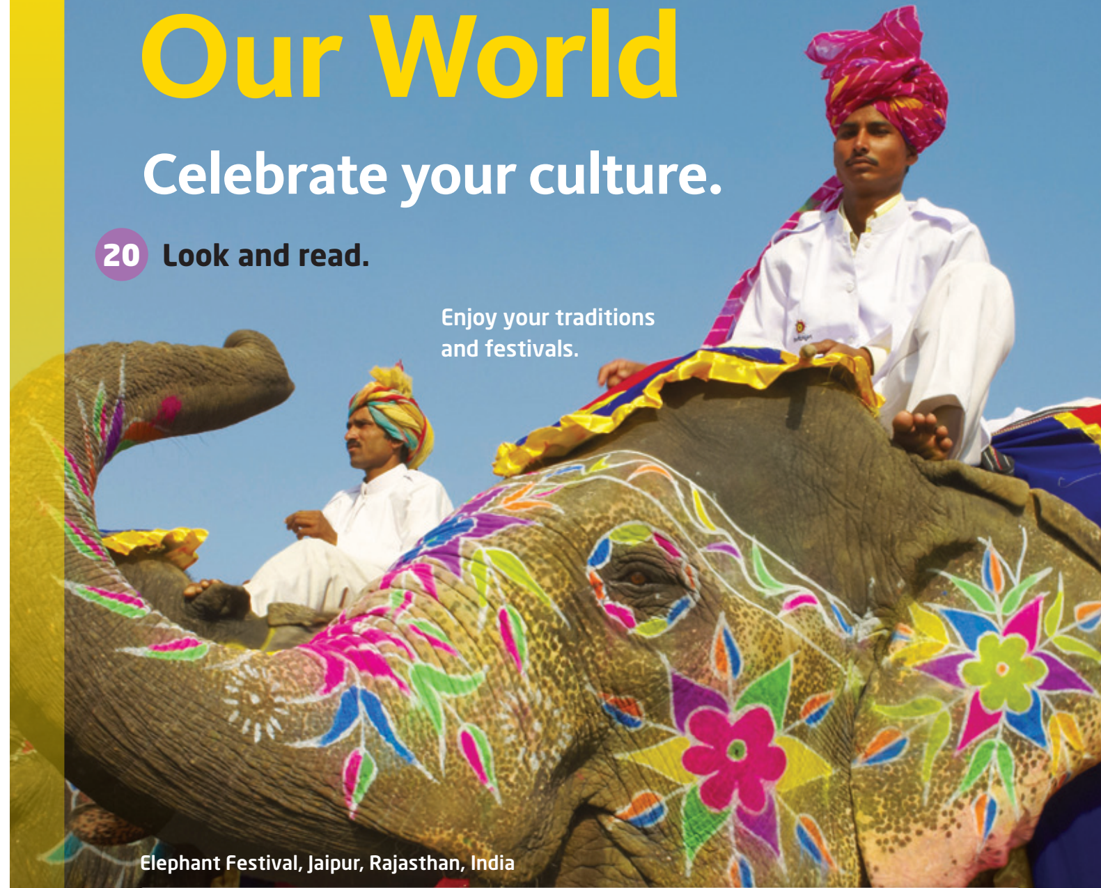
Elephant Festival, Jaipur, Rajasthan, India