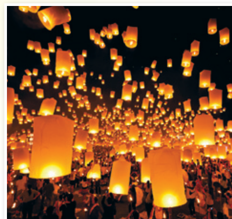
Festival of Yi Peng

In Thailand, the festival of Yi Peng usually happens in November, too. On the first day, there is a parade and people wear beautiful costumes. People make lanterns out of rice paper. They light small candles inside them. The warm air makes the lanterns go up into the sky. On the night of the festival, there are thousands of bright lanterns in the sky. It's very beautiful. People imagine that the lanterns are taking away the bad things in their lives. People also decorate their homes and gardens with paper lanterns. And on the last day, there are fireworks.