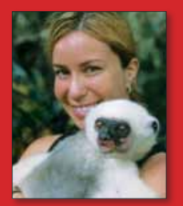
Mireya Mayor, Ph.D. National Geographic Emerging Explorer Primatologist, Conservationist