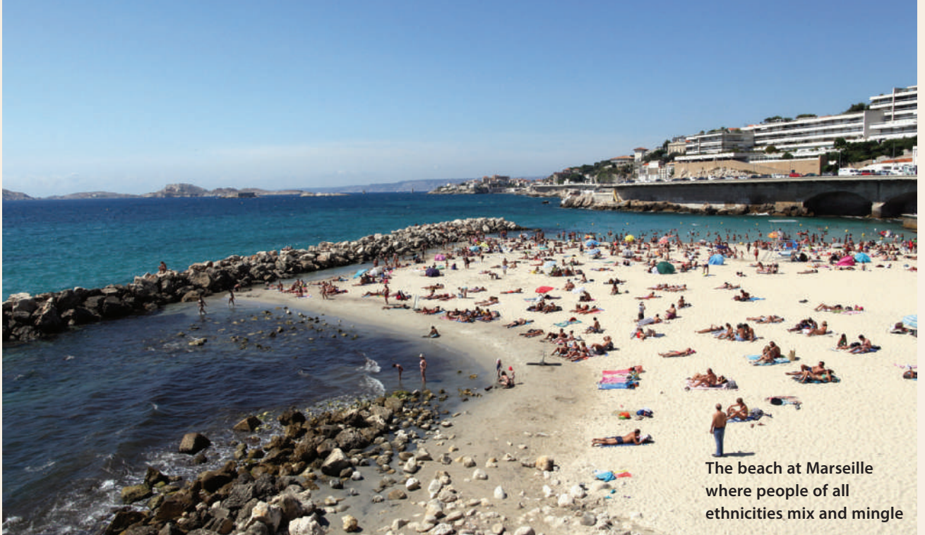
The beach at Marseille where people of all ethnicities mix and mingle

descent. He does not know how many have Muslim roots. In France, it's against the law for any government official to record a citizen's race, religion, or ethnicity. Church and state are not only separate, but religion is officially ignored. If you are French, you are French: nothing more, nothing less, and nothing else.