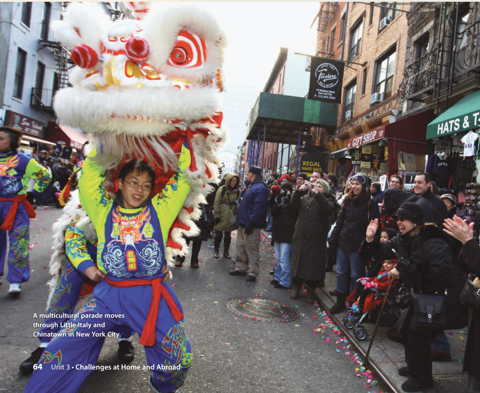
A multicultural parade moves through Little Italy and Chinatown in New York City.