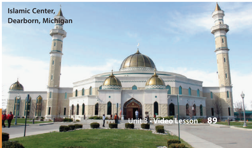
Islamic Center, Dearborn, Michigan