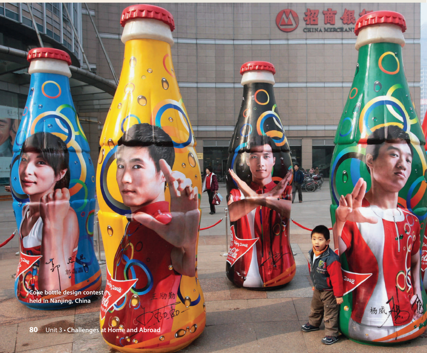
Coke bottle design contest held in Nanjing, China