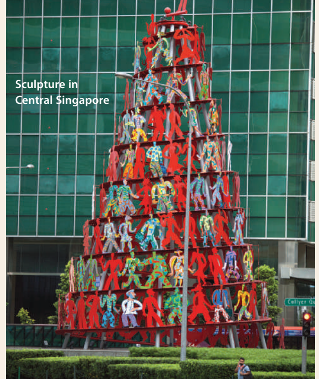
Sculpture in Central Singapore

But there is a positive side. You could feel it during the “We Are the World” performance in the National Day show. On stage were representatives of Singapore’s major ethnic groups: the Chinese, Malays, and Indians. After violent protests in the 1960s, the government started a strict system in public housing that required the different ethnic groups to live together. The purpose of this system may have been to control the population, but the apparently sincere expression of racial harmony at the performance was impressive.