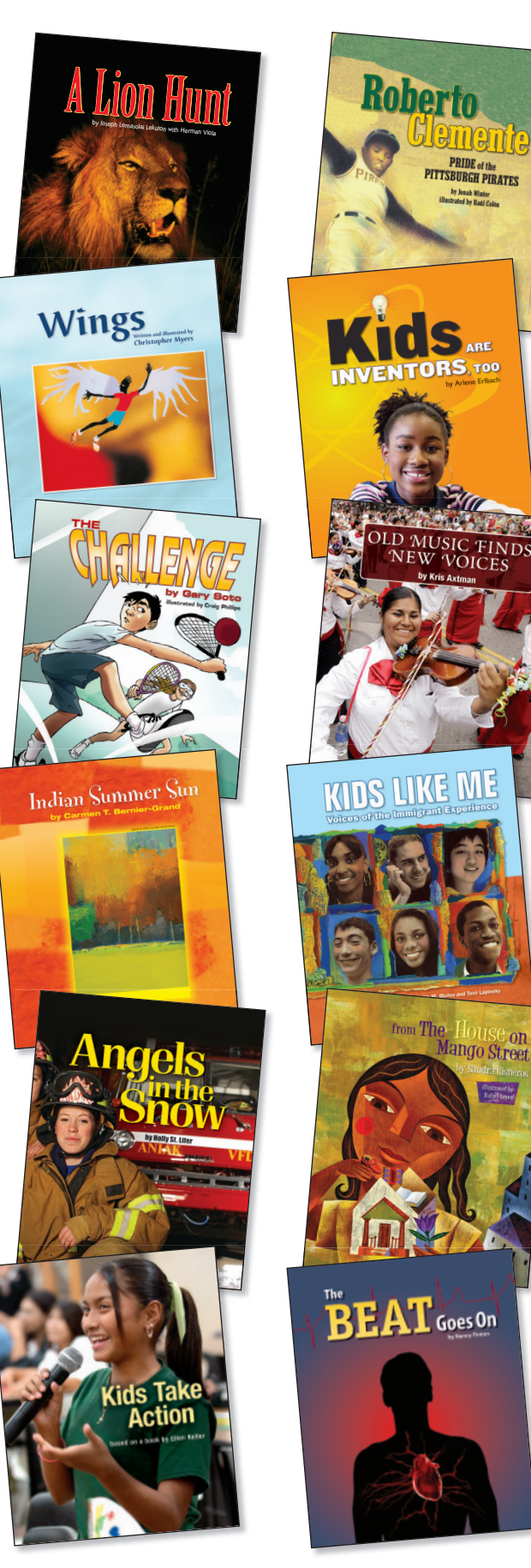
Engaging literature selections bridge the gap between students' in-school and out-of-school lives.