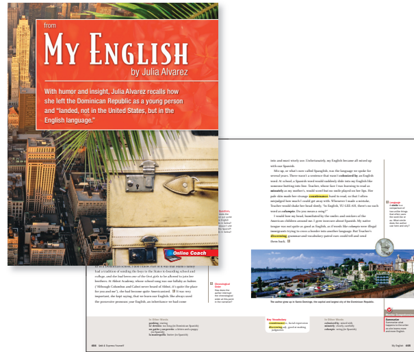
“My English” reflects on the immigrant experience.