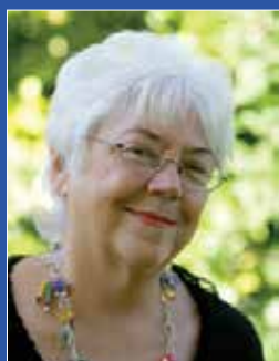
Alma Flor Ada